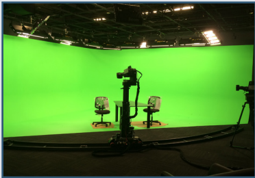
Super 3EZ - Built-In