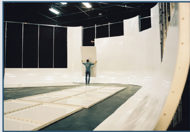
System 4FS - Freestanding

Pro Cyc cycloramas can be seamlessly integrated into existing sheetrock walls or constructed completely freestanding, independent of any other walls or support. This versatility allows for easy relocation or expansion of your studio setup. All Pro Cyc systems incorporate our patented non-parabolic corner, designed to enhance both lighting and sound quality in your studio.